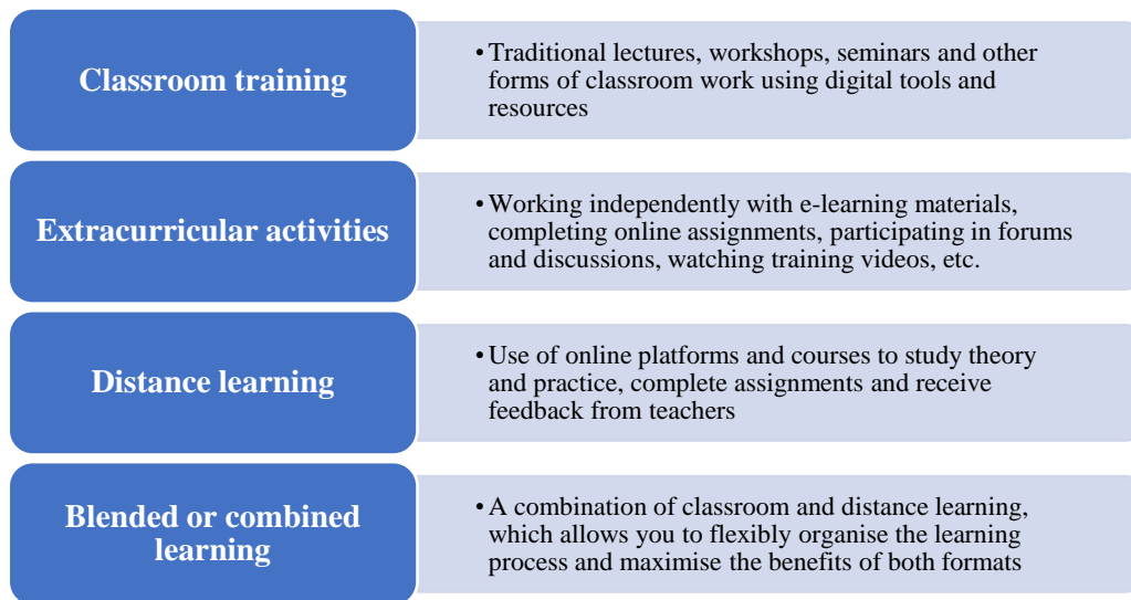
Fig. 2. Areas of implementation of digital technologies in the educational process

world. In the training of future lawyers, we actively use various forms of learning activities based on digital technologies that have proven to be effective (Fig. 2).