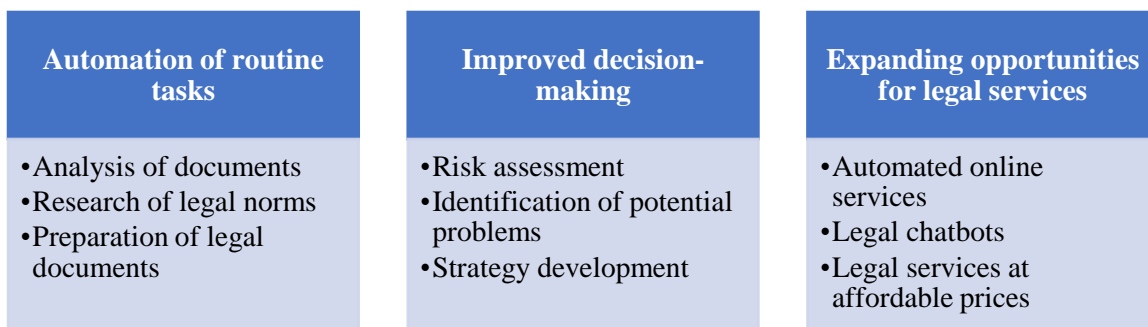
Fig. 3. Key features of AI use by lawyers

The use of artificial intelligence in the professional training of future lawyers is quite interesting and promising, as artificial intelligence is rapidly integrating into various spheres of life, and legal practice is no exception. Lawyers use AI to improve their work efficiency, increase accuracy, and expand the scope of legal services (Fig. 3).